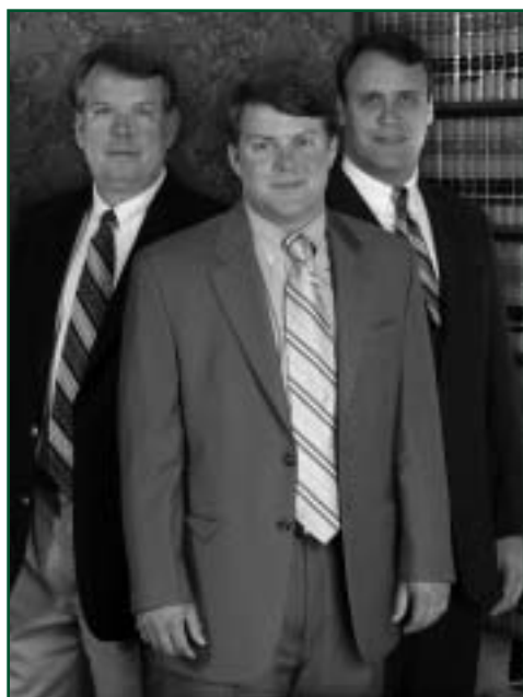
Leaders in car accident claims and litigation

The new M&W web site can be found at www.moore-wolfe.com If you know some one who has been injured in a car accident, please encourage them to visit this web site to learn more about their rights and the legal issues related to their claim or case.